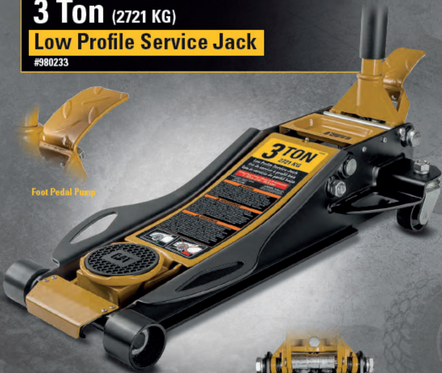
Foot Pedal Pump