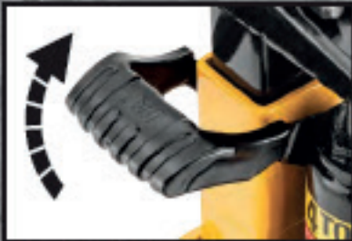
Integrated Patented Auto-Lock for Safety