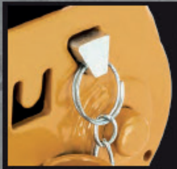
Double Locking Safety Pin