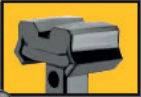
Pinch Weld Adapter Prevents Damage to Vehicle