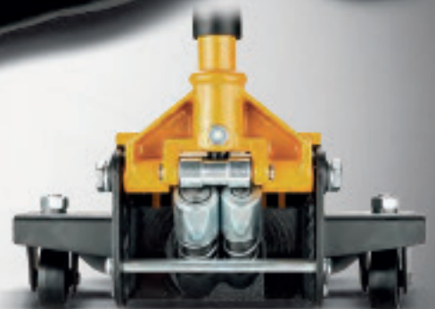
Dual Pump Fast Lift